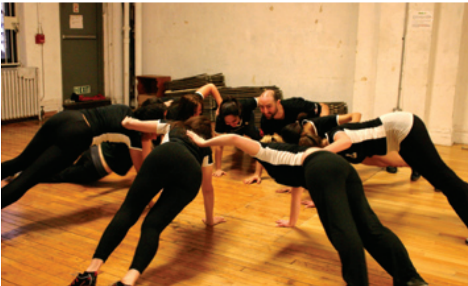
Essential for any spy: a sense of balance.

lunch is served to us at two tables pushed together. We drink diet Cokes and eat tuna tartar, mini egg rolls, veggie sandwiches, fried mushroom risotto hors d'oeuvres, and tiny cheesecakes for dessert. And then I'm ready to lie down on the floor and fall into a coma.