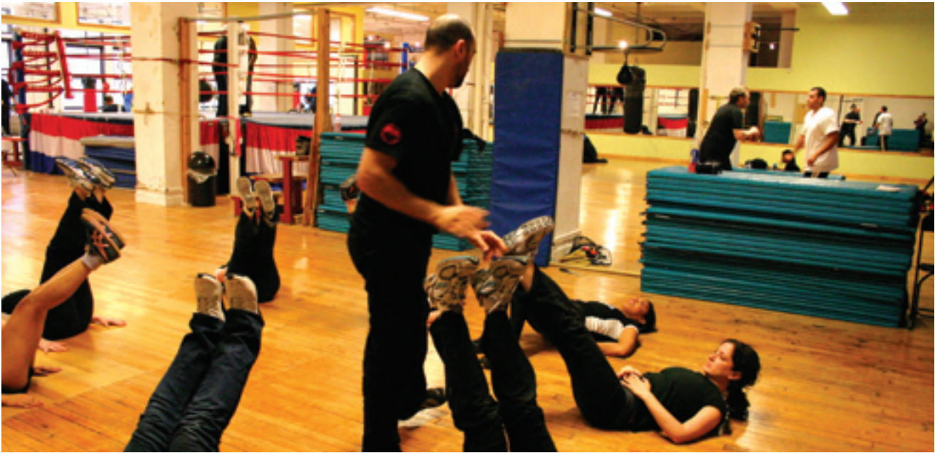
The author (r.) learns that her legs can defy gravity.