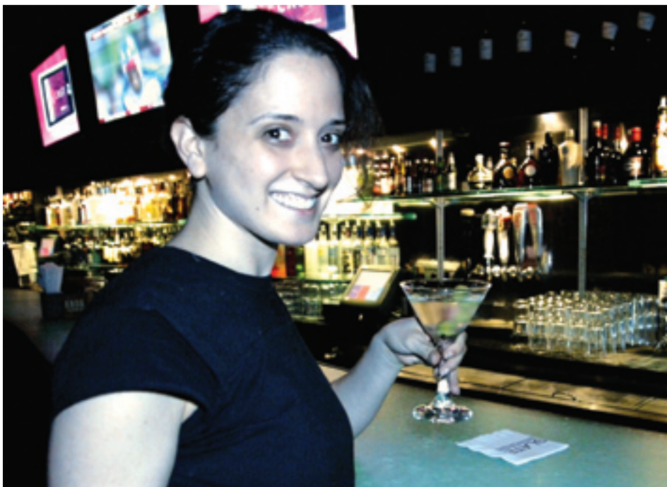
The hardest part of spydom: staying sober.